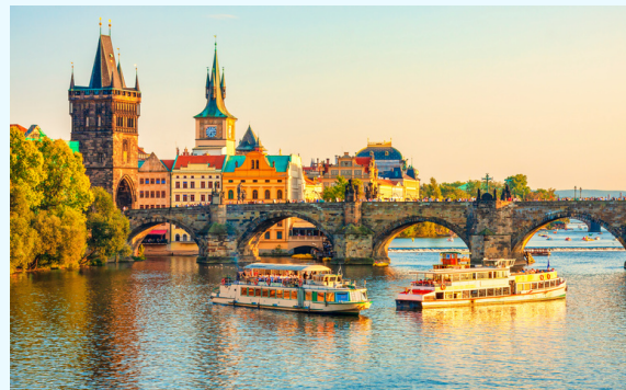
Charles Bridge crossing the Vltava river in Prague