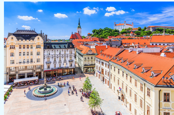
Charming Old Town Bratislava, Slovakia

Our journey extends beyond the history books, offering a contemporary lens on Europe's political and economic landscape. You will engage in enlightening discussions with local experts, policymakers, and scholars to grasp the nuanced challenges facing the continent today. From the politics of NATO to the complexities of migration and economic integration, participants will gain a comprehensive view of Europe's current affairs through interactive discussions led by seasoned historians, political analysts, and economists.