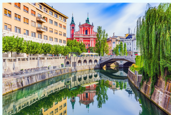
Triple Bridge from the Ljubljanica River