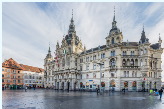
Government House of Graz