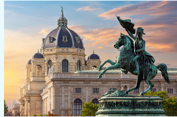
Heldenplatz (Heroes' Square) near Hofburg Palace in Vienna

On this trip you will tour historic sites of World War II history, including Vienna's Heldenplatz and the Prague church where Czech resistance fighters made a heroic stand against the brutal Nazi regime after Operation Anthropoid. Our expert guides will provide context, ensuring a profound understanding of the events that shaped the course of history.