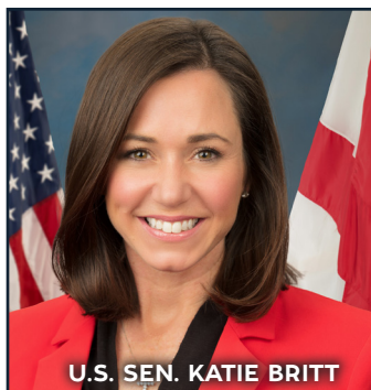
U.S. SEN. KATIE BRITT

Please join The Fund for American Studies (TFAS) on July 11, 2024 , at The Four Seasons Hotel in Washington, D.C., for a special celebration honoring today's congressional and business leaders and supporting our future leaders—the 2024 TFAS students. Your involvement will make a powerful difference in our nation's future by enabling students with outstanding leadership potential to attend the TFAS D.C. Summer Programs track on Business + Government Relations.