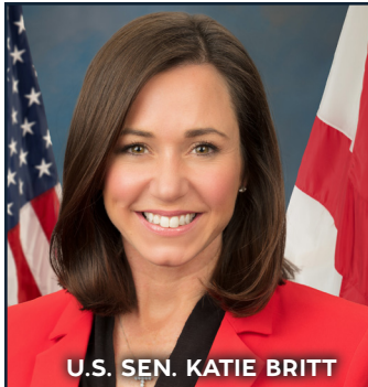
U.S. SEN. KATIE BRITT

Please join The Fund for American Studies (TFAS) on July 11, 2024 , at The Four Seasons Hotel in Washington, D.C., for a special celebration honoring today's congressional and business leaders and supporting our future leaders—the 2024 TFAS students. Your involvement will make a powerful difference in our nation's future by enabling students with outstanding leadership potential to attend the TFAS D.C. Summer Programs track on Business + Government Relations.