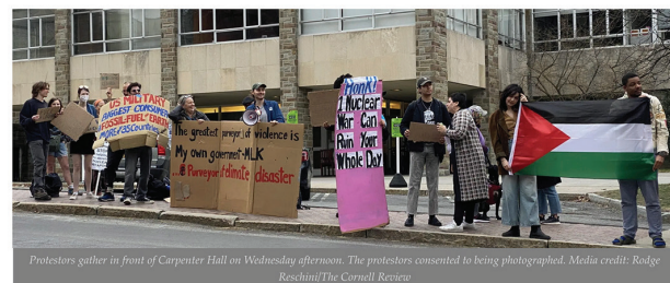
Protestors gather in front of Carpenter Hall on Wednesday afternoon. The protestors consented to being photographed. Media credit: Rodge Reschini/The Cornell Review

© Rodge Reschini | October 12, 2023 | 3 min read